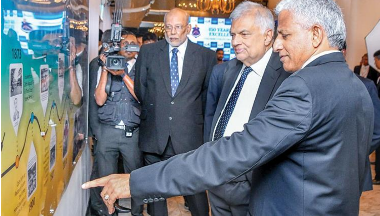
President Ranil Wickremesinghe was the Chief Guest at the celebrations to mark the 150th anniversary of Colombo Colts Cricket Club