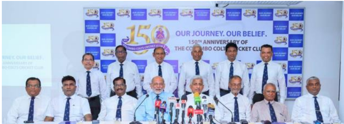
2 nd June 2023

The following event was attended by the president of Sri Lanka.