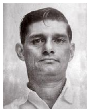
Conroy Ivers Gunasekera