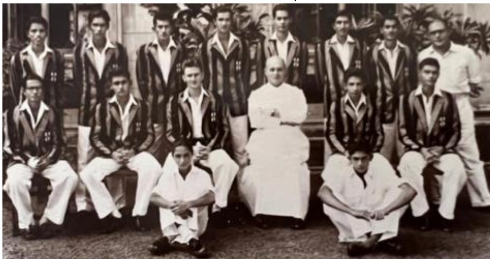
ST. THOMAS' FIRST XI, 1956